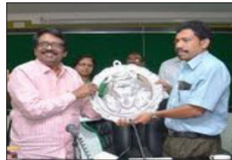
Comptroller presenting a memento their help, support and contribution for my efforts to KAU's development', he said.