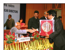
Union Minister Sharad Pawar congratulates KAU VC