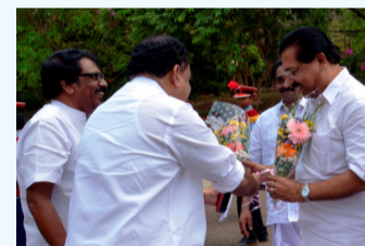
P.C. Chacko MP being received by Vice-Chancellor & MLA

P.C. Chacko, in his address said that the grant, if utilized properly, will attract more support from the centre. 'Prove your capabilities and pave way for more funding. KAU is one among the two Universities sanctioned such a grant this year. I'll be with you and we together should be able to raise this University to the level of an international Centre of excellence' he said.